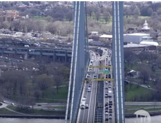
Accidents on the Verrazano-Narrows Bridge can be cleared much more quickly following the New York MTA's adoption of Oracle Mobile Cloud Service.

For example, Ortega wants to develop a mobile application for employees who work on a train, drive a bus, or do other field work, so that they don't have to return to the office to pick their next assignment, submit a time sheet, or select vacation time.